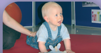
See you later...