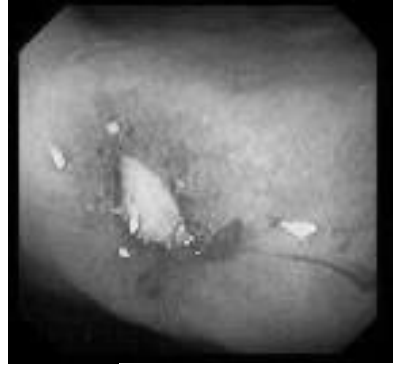
Example of the appearance, at TNE, of an ulcer in the bottom of the stomach

You may have complained of some form of indigestion, heartburn or another problem, such as difficulty swallowing, nausea, vomiting, feeling full quickly when eating, or losing weight. Alternatively, you may have been found to be anaemic (low blood count), having a review of the gullet lining when a condition called Barrett's Oesophagus has been diagnosed or trying to diagnose, exclude or follow up a condition called Coeliac disease.